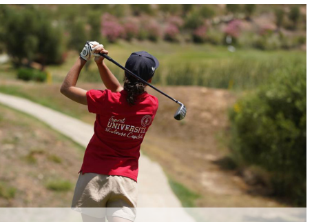
Female player of Toulouse 1 Capitol University